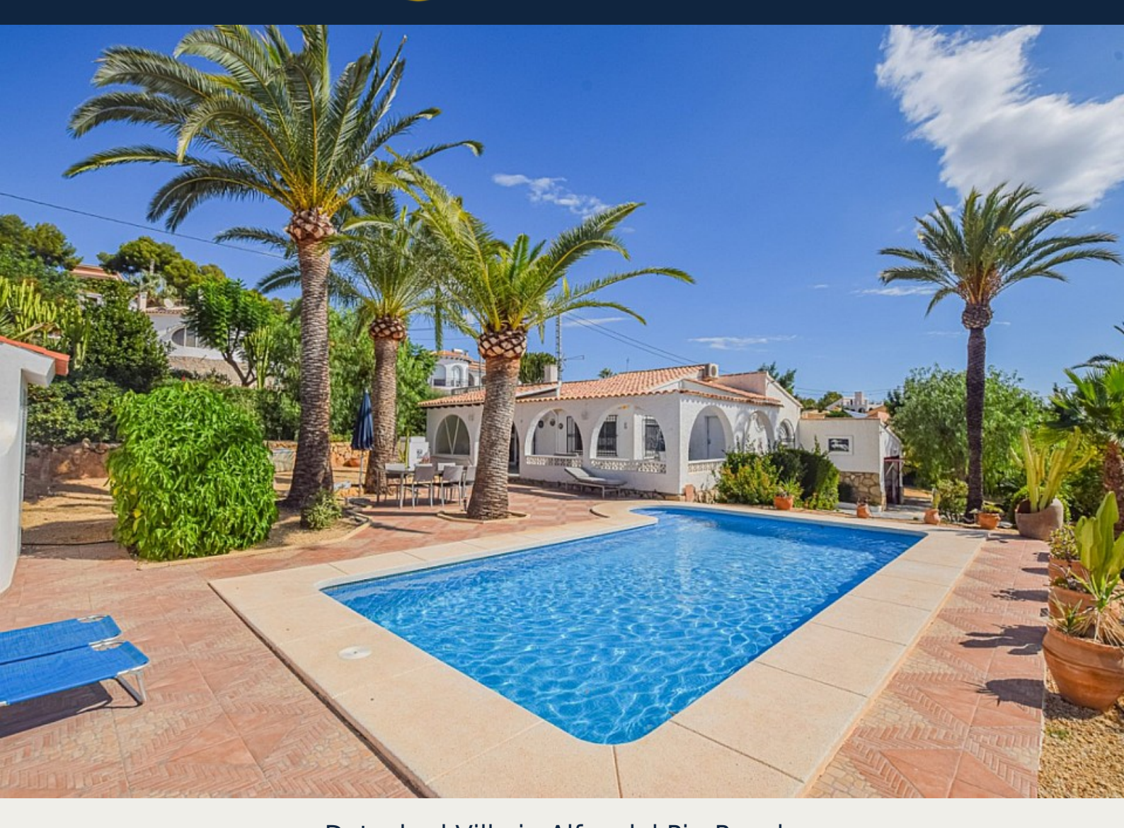
Detached Villa in Alfas del Pi - Resale