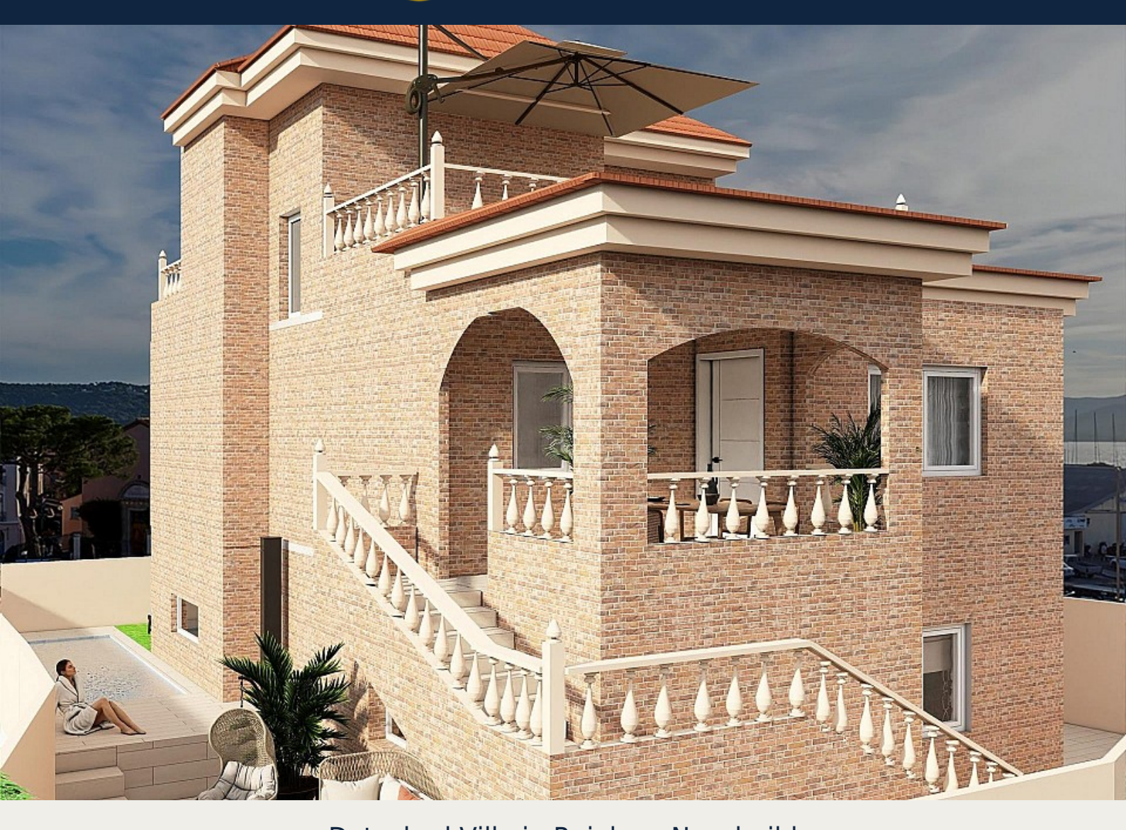
Detached Villa in Rojales - New build