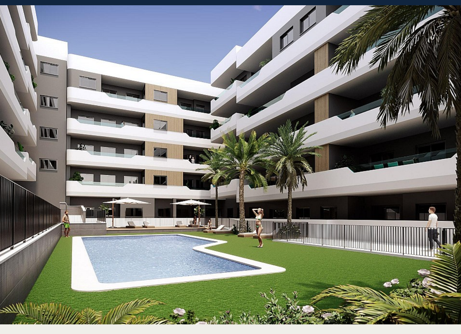
Apartment in Santa Pola - New build