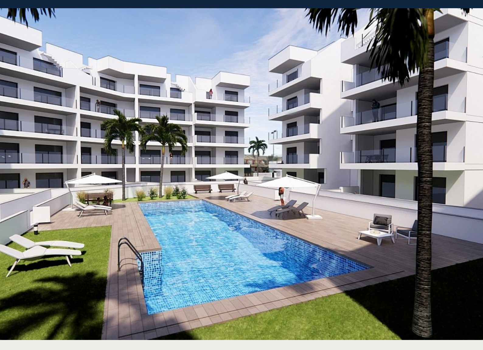
Apartment in Los Alcázares - New build