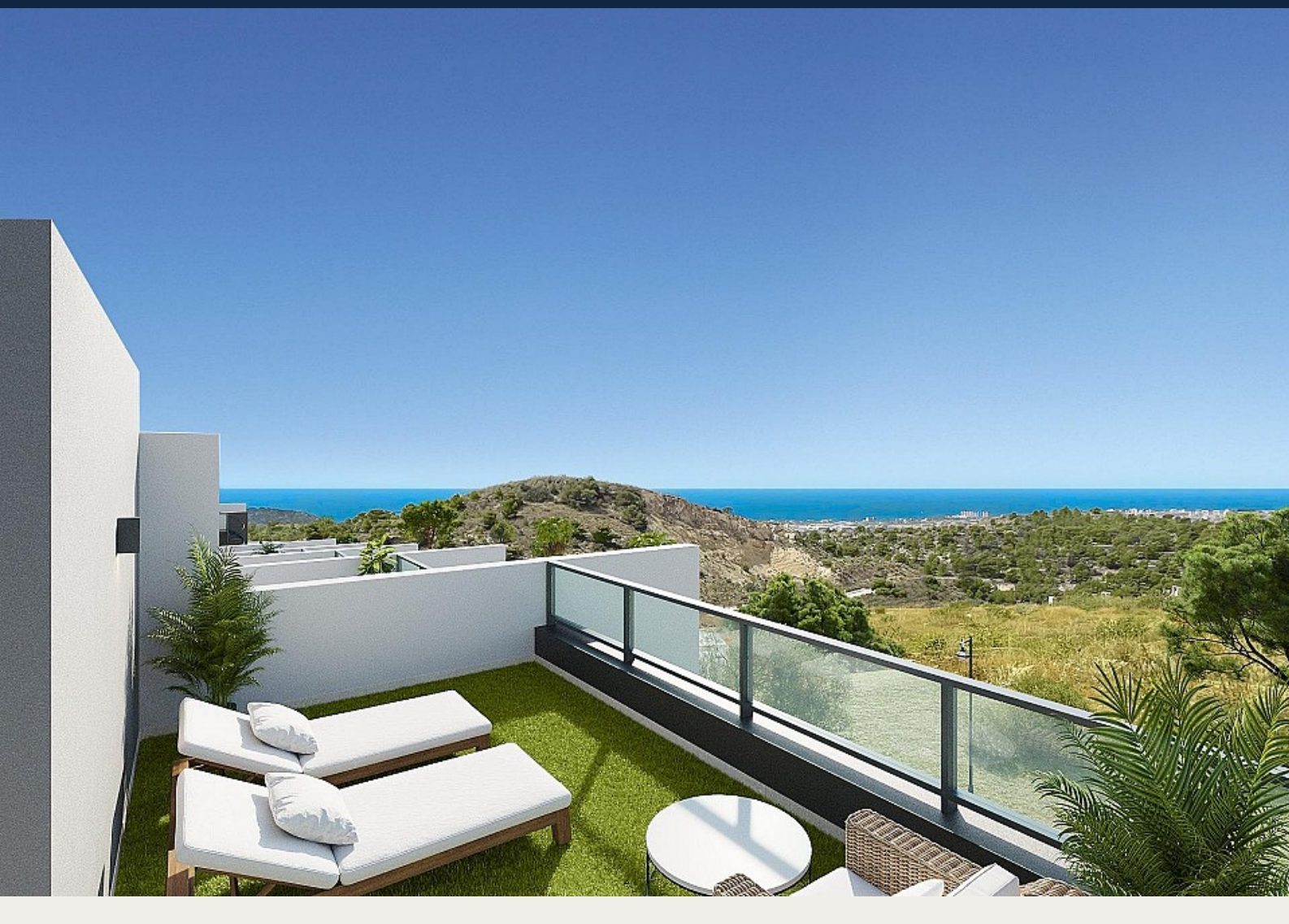
Detached Villa in Finestrat - New build