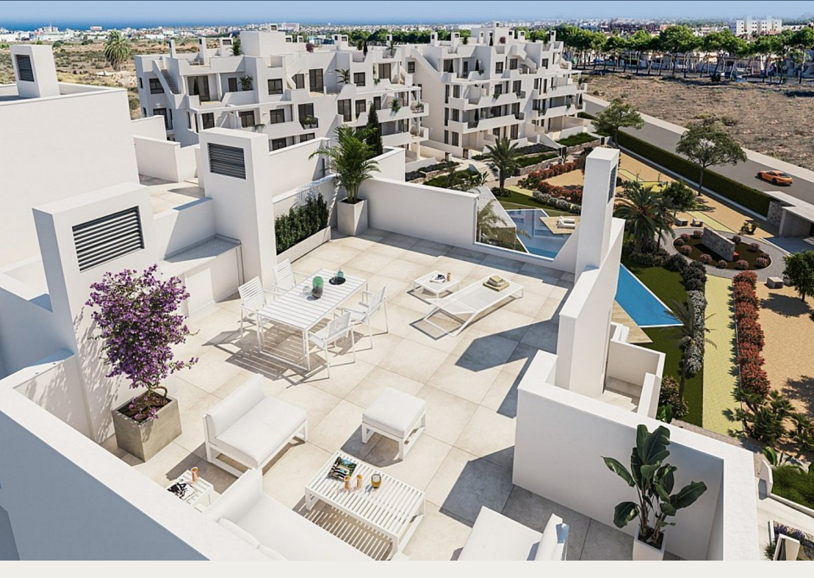
Penthouse in Torre Pacheco - New build