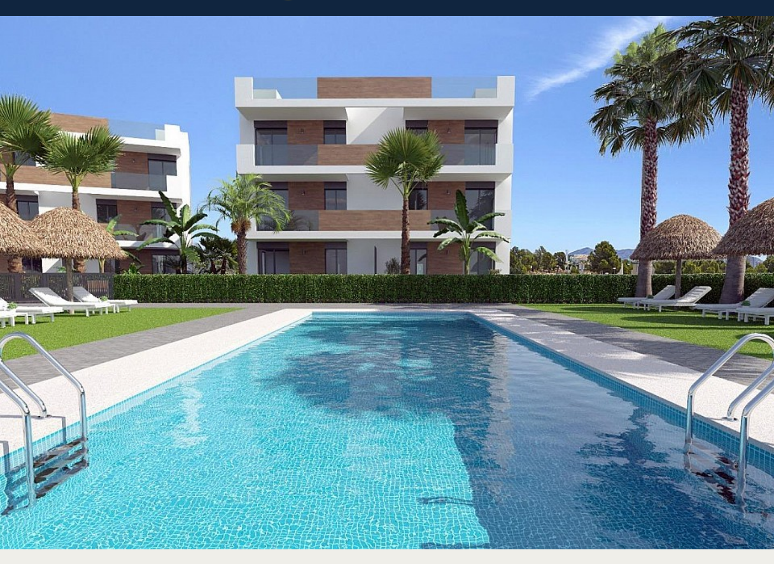
Penthouse in Los Alcázares - New build