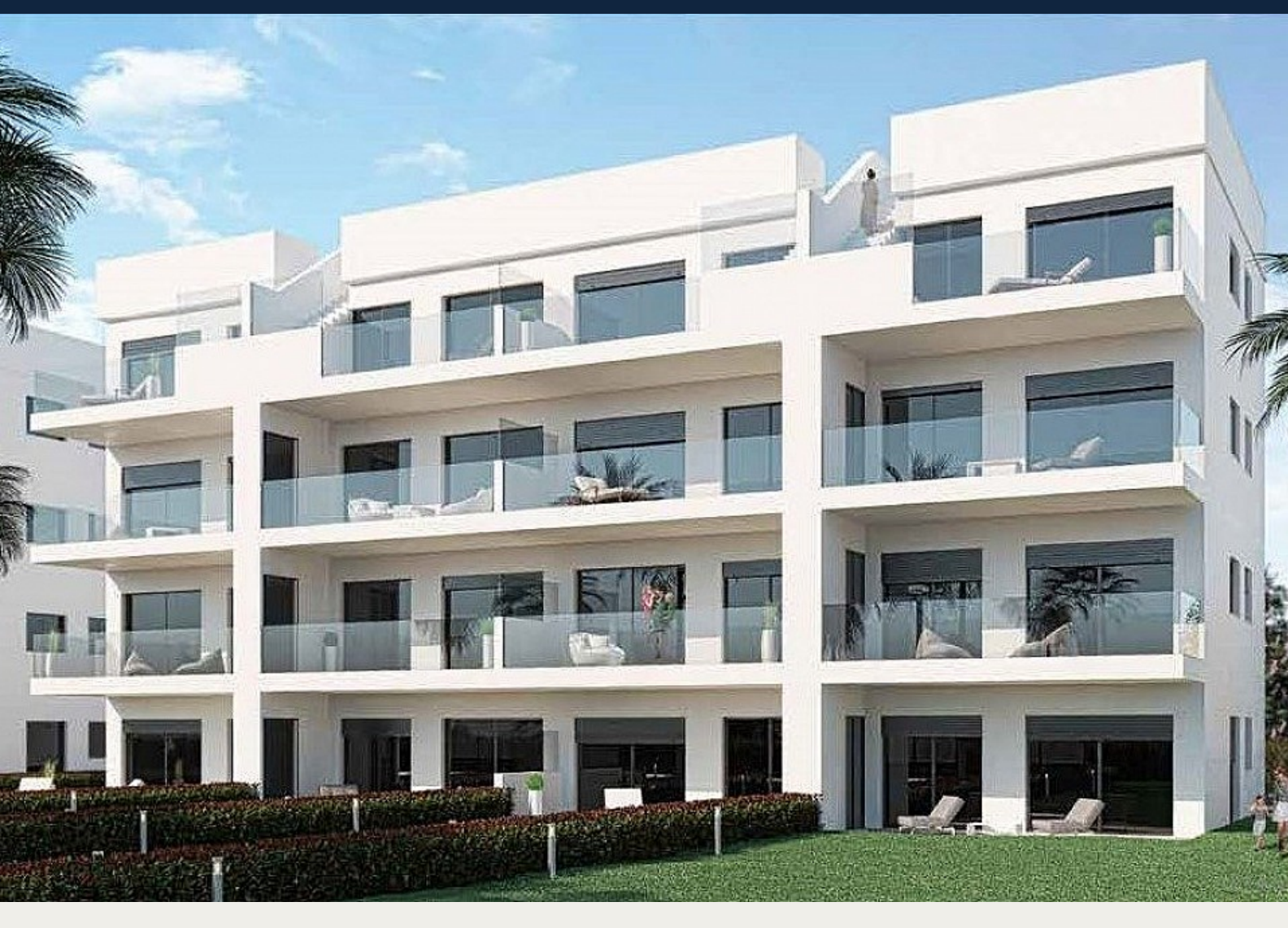
Apartment in Alhama De Murcia - New build