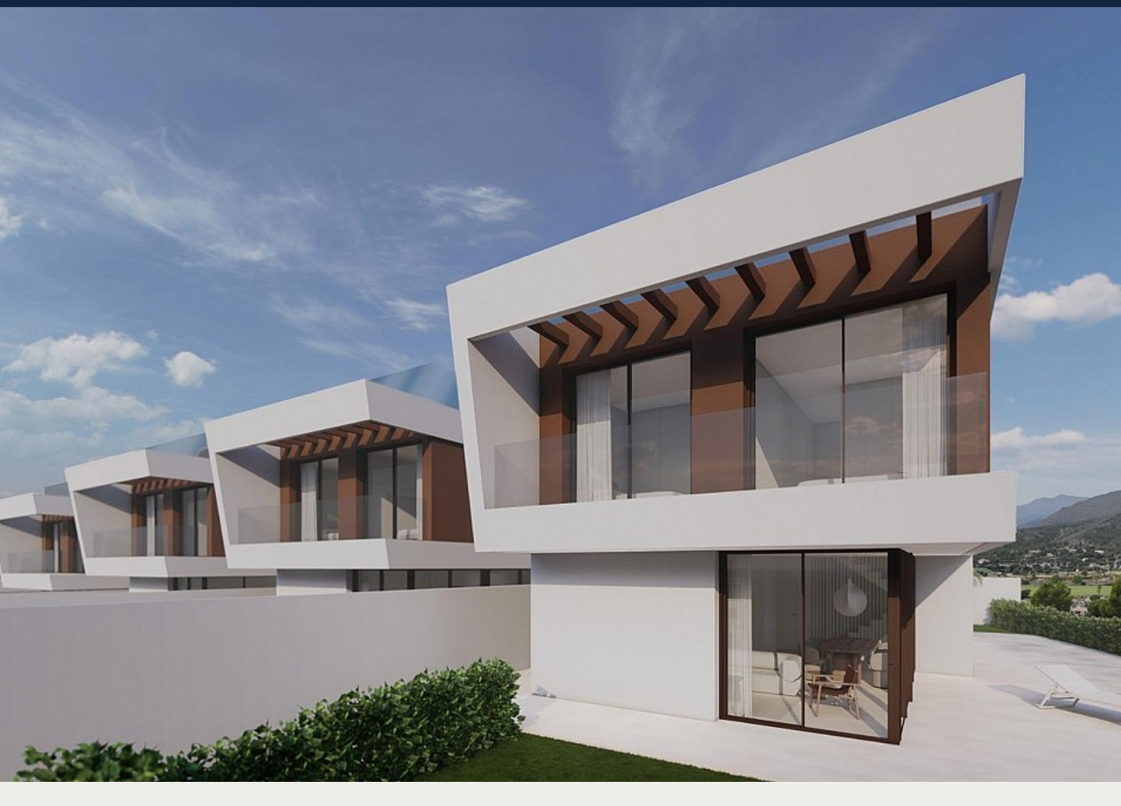
Detached Villa in Finestrat - New build