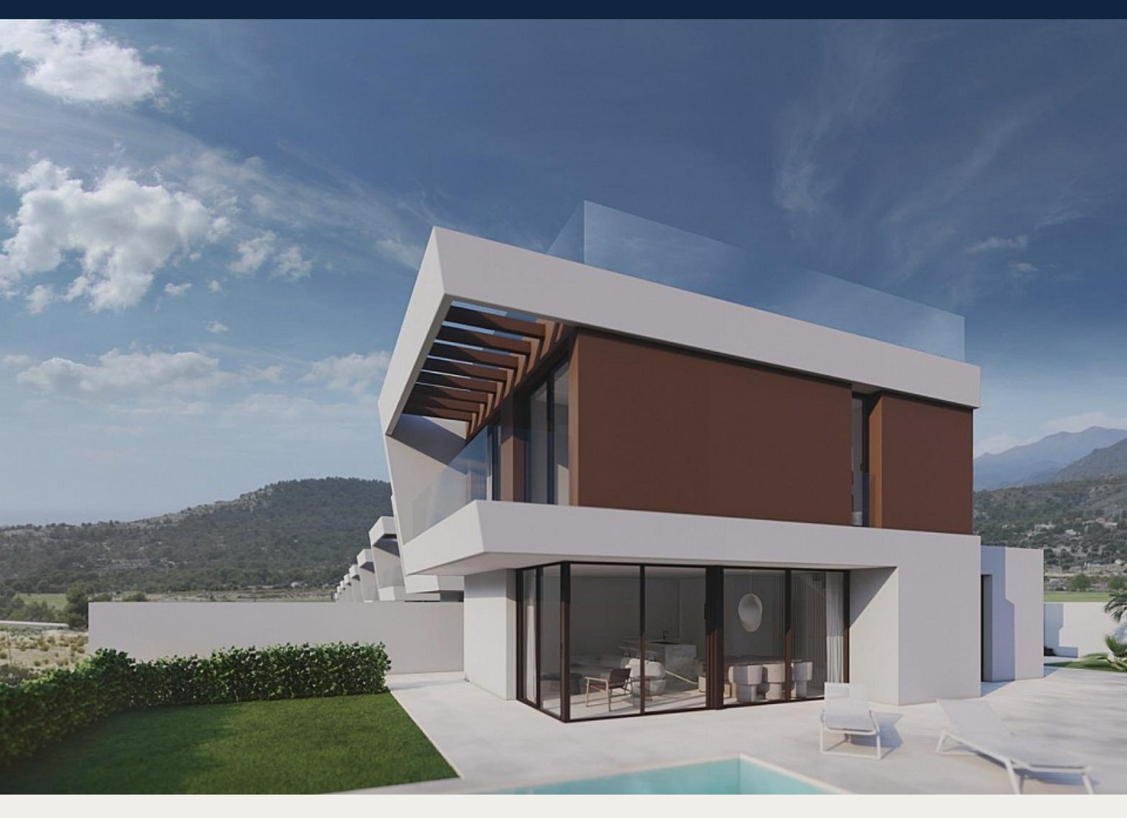
Detached Villa in Finestrat - New build