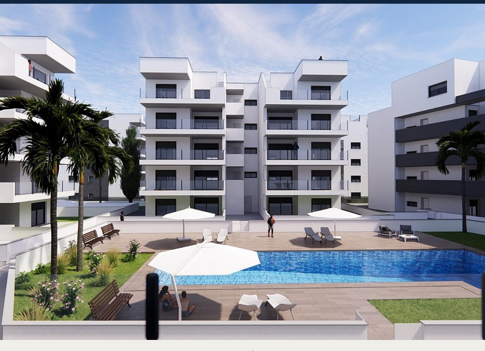
Penthouse in Los Alcázares - New build