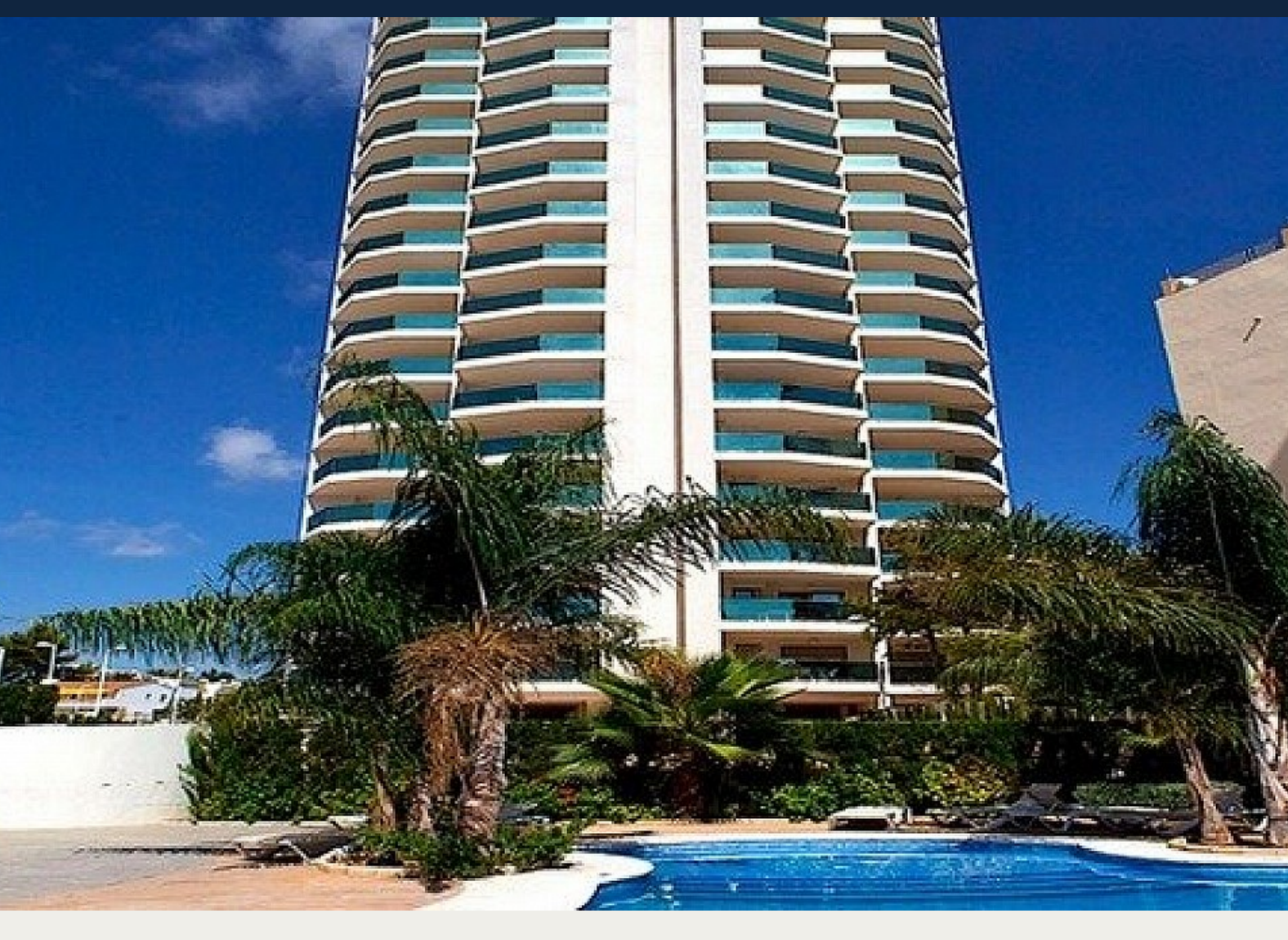
Apartment in Calpe - New build