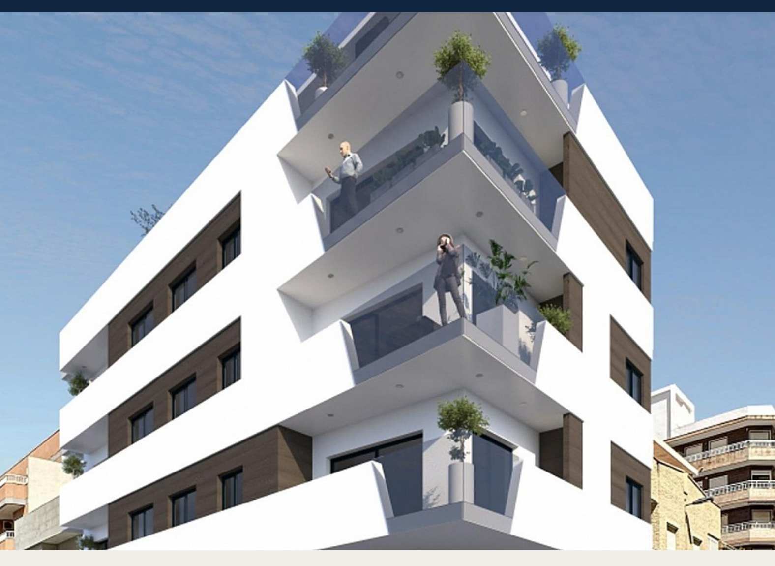
Apartment in Torrevieja - New build