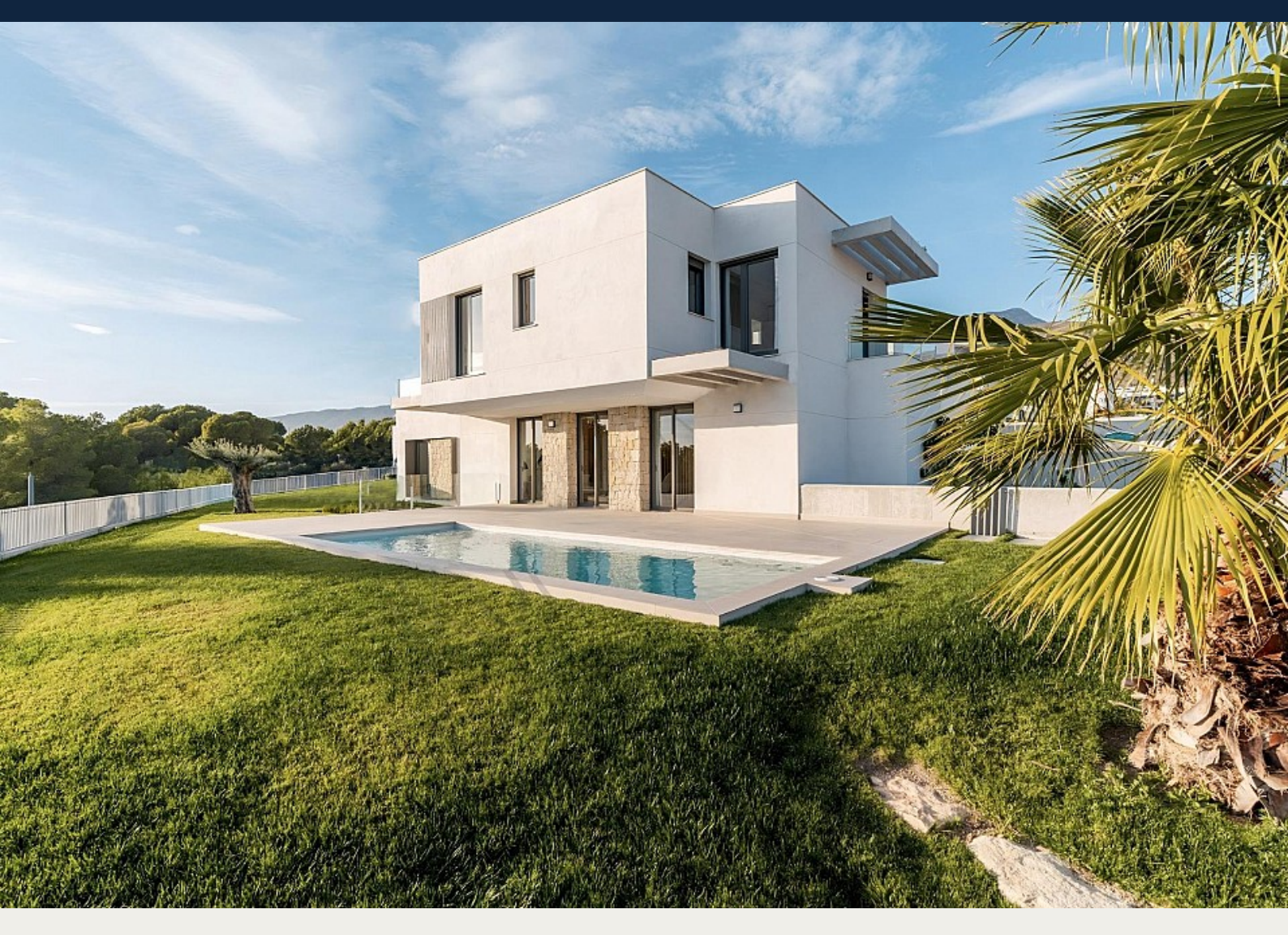
Detached Villa in Finestrat - New build