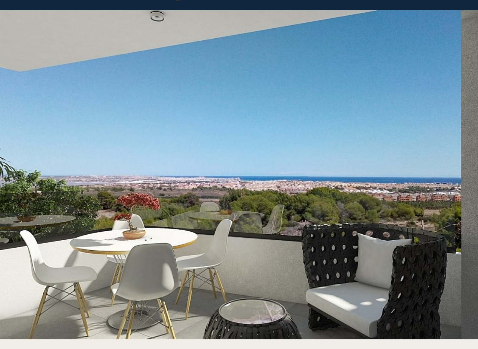
Apartment in Orihuela Costa - New build