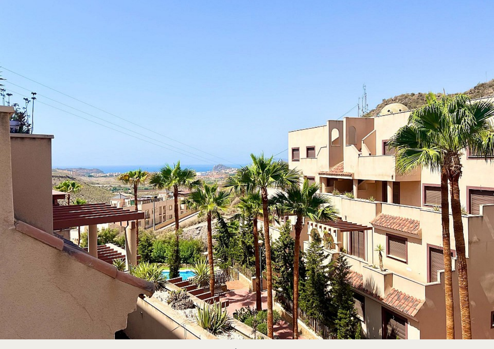
Penthouse in Águilas - New build