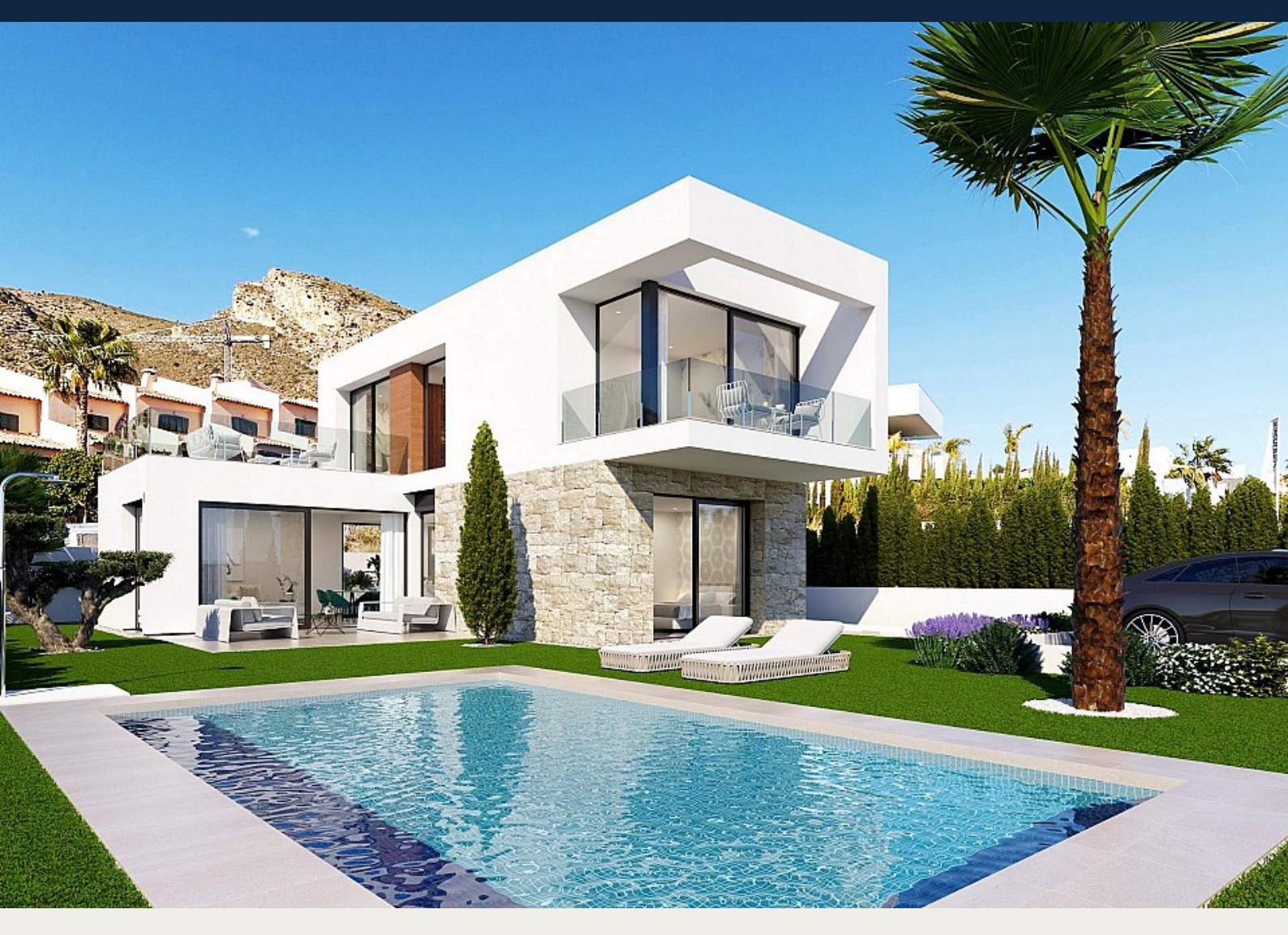
Detached Villa in Finestrat - New build