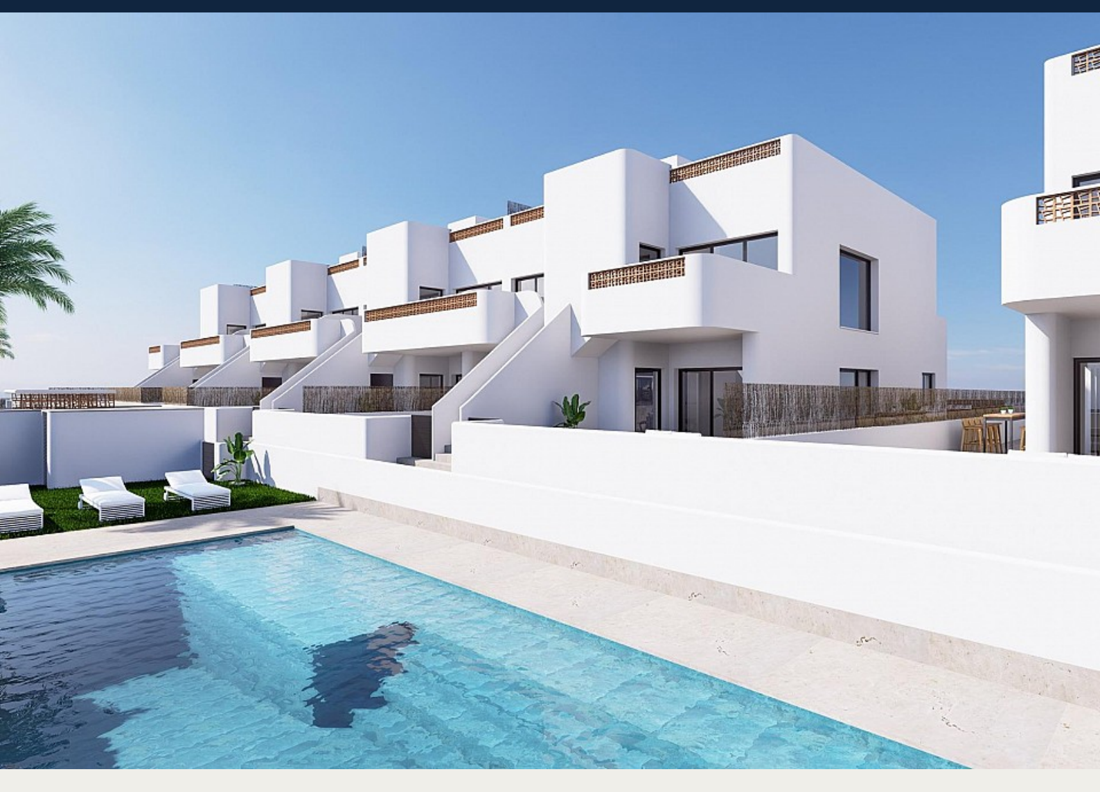
Bungalow in Dolores - New build