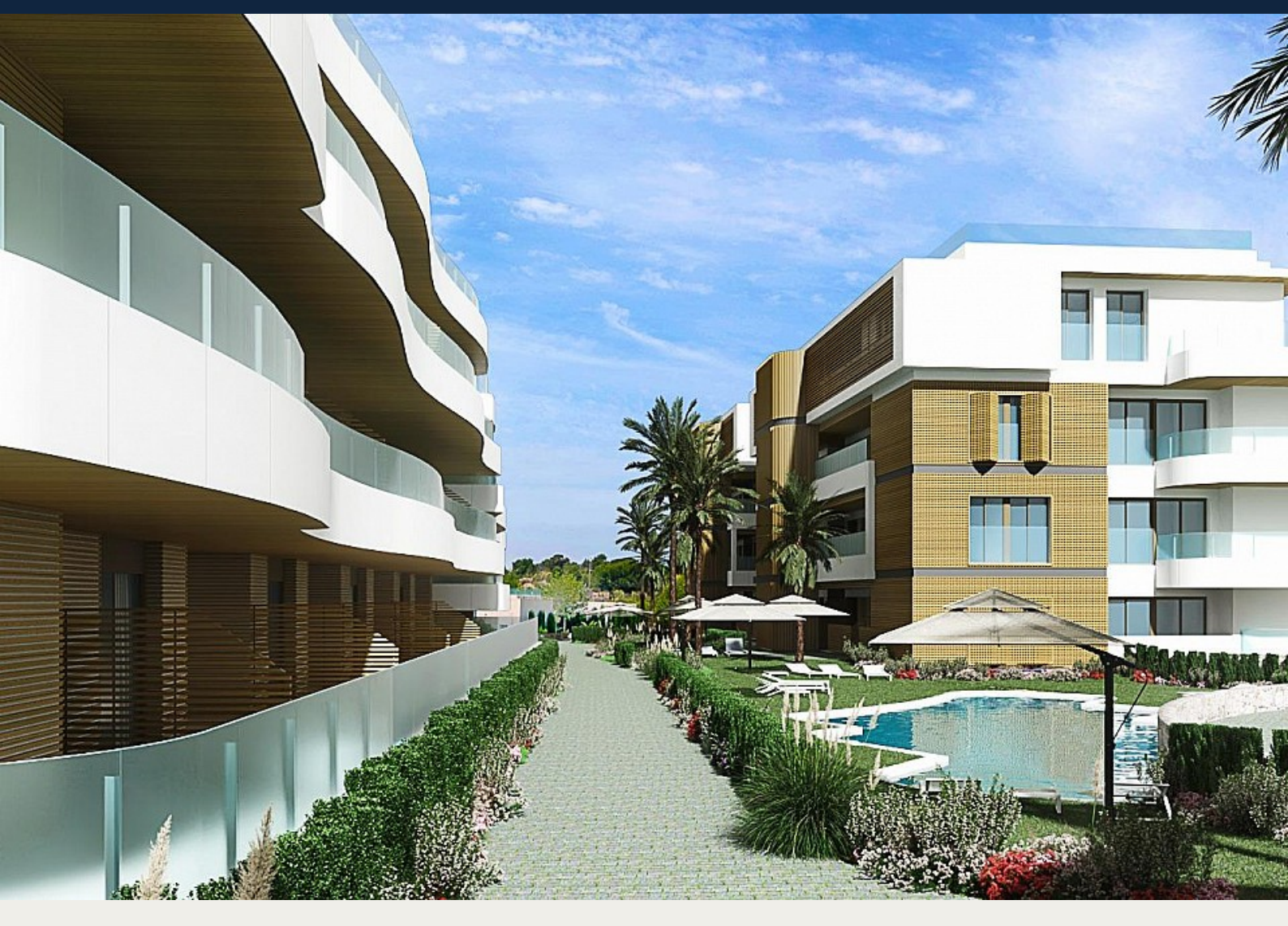
Apartment in Orihuela Costa - New build