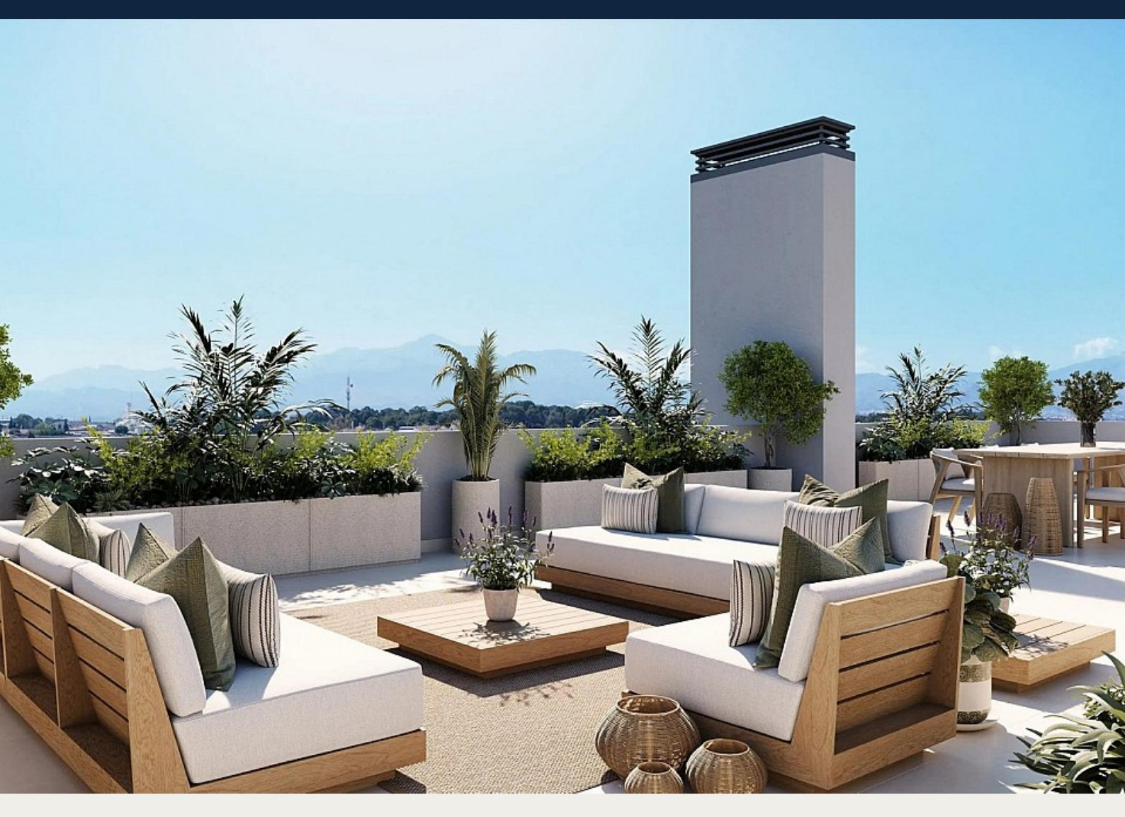
Penthouse in Alicante - New build