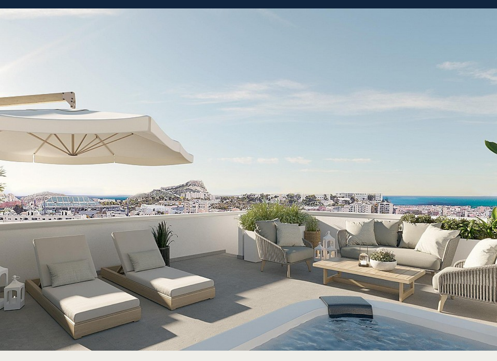
Penthouse in Alicante - New build