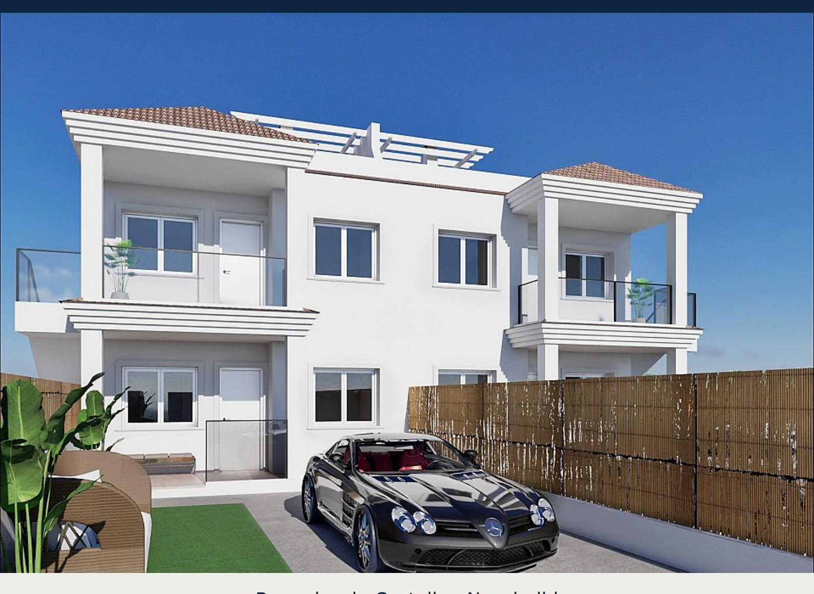
Bungalow in Castalla - New build