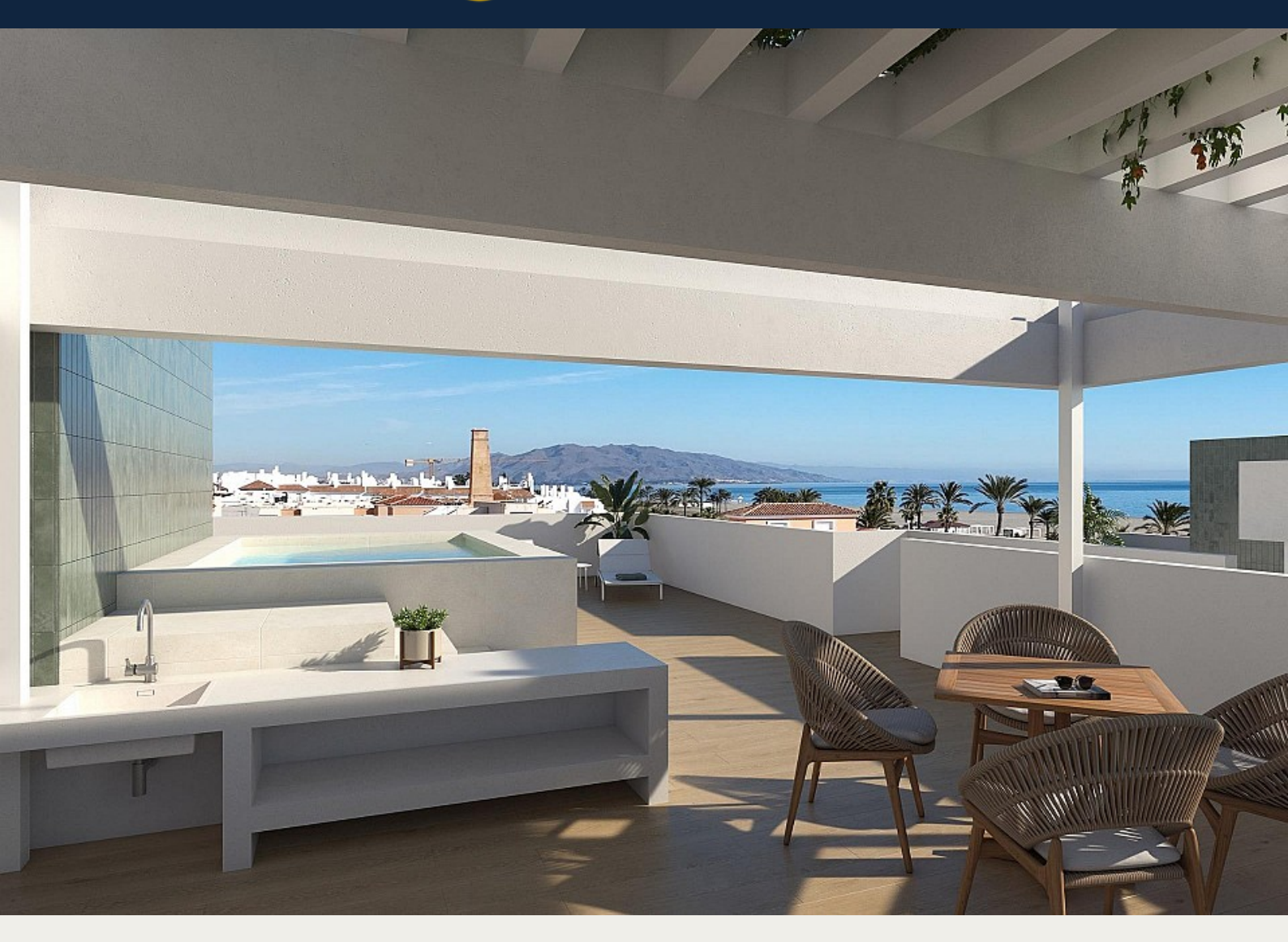
Penthouse in Vera Playa - New build