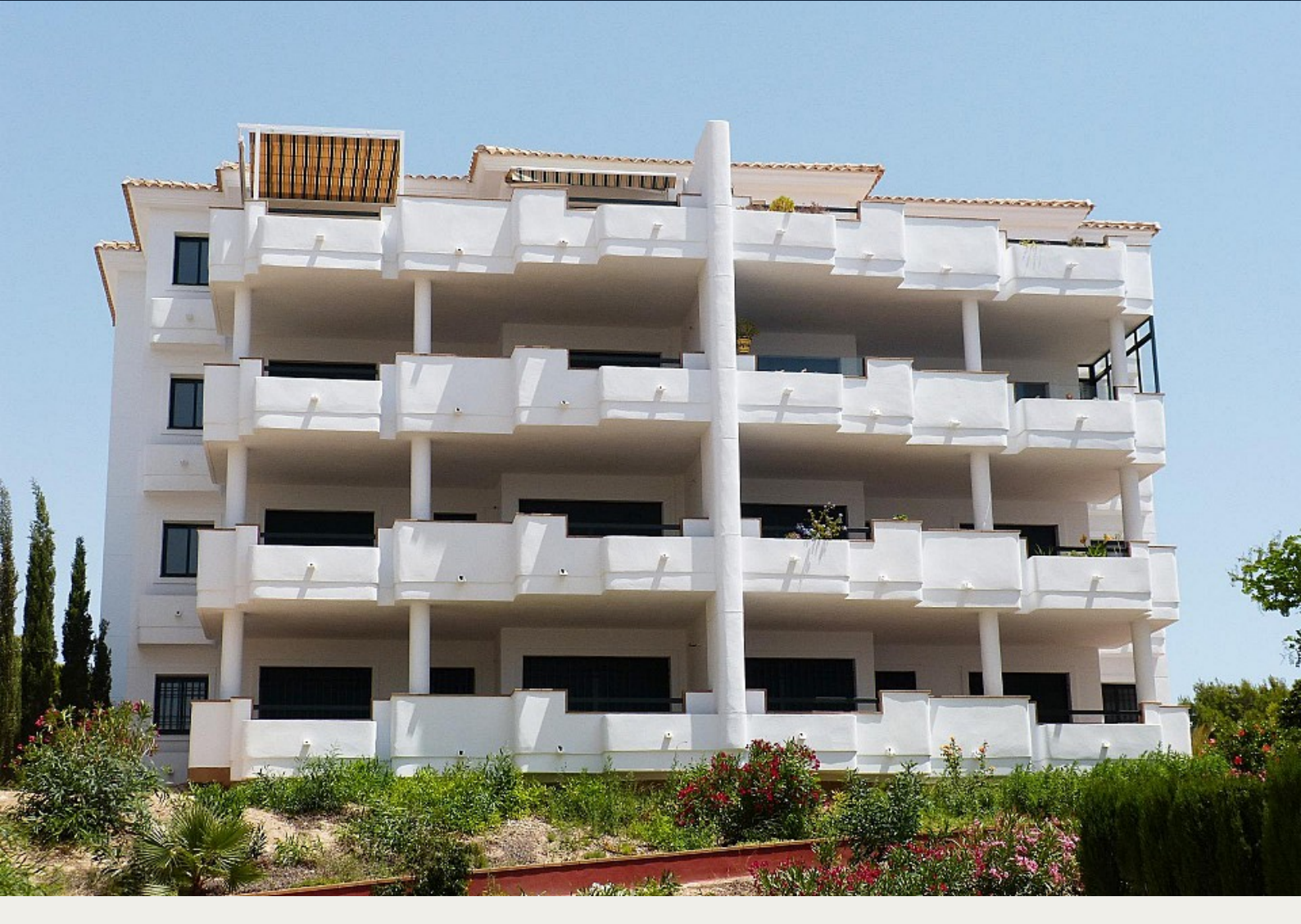
Penthouse in Orihuela Costa - New build