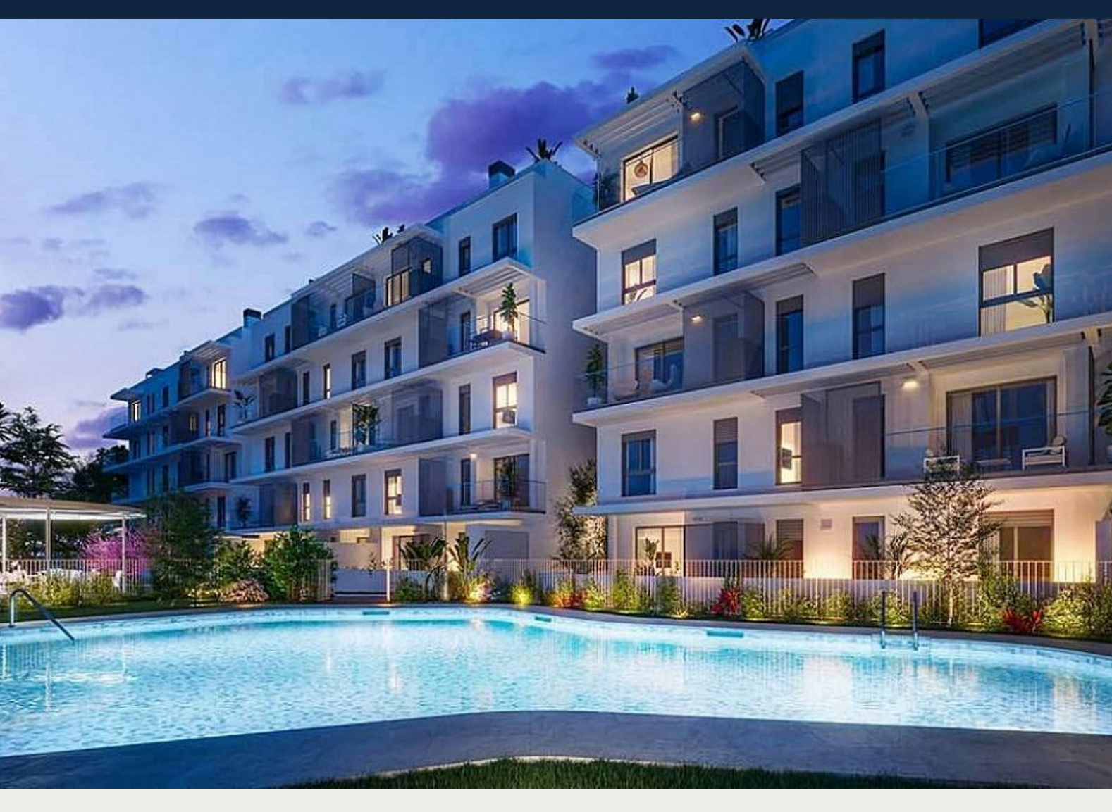
Apartment in Denia - New build