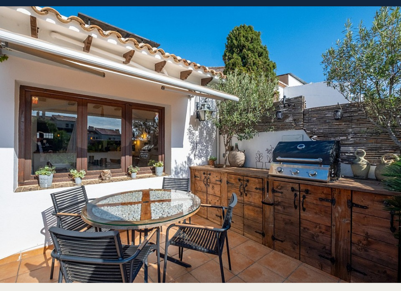
Bungalow in Altea - Resale