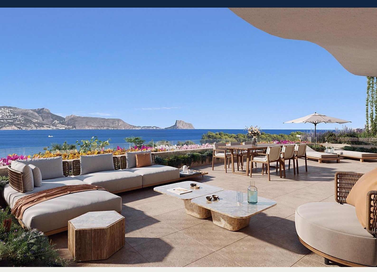
Penthouse in Alfas del Pi - New build