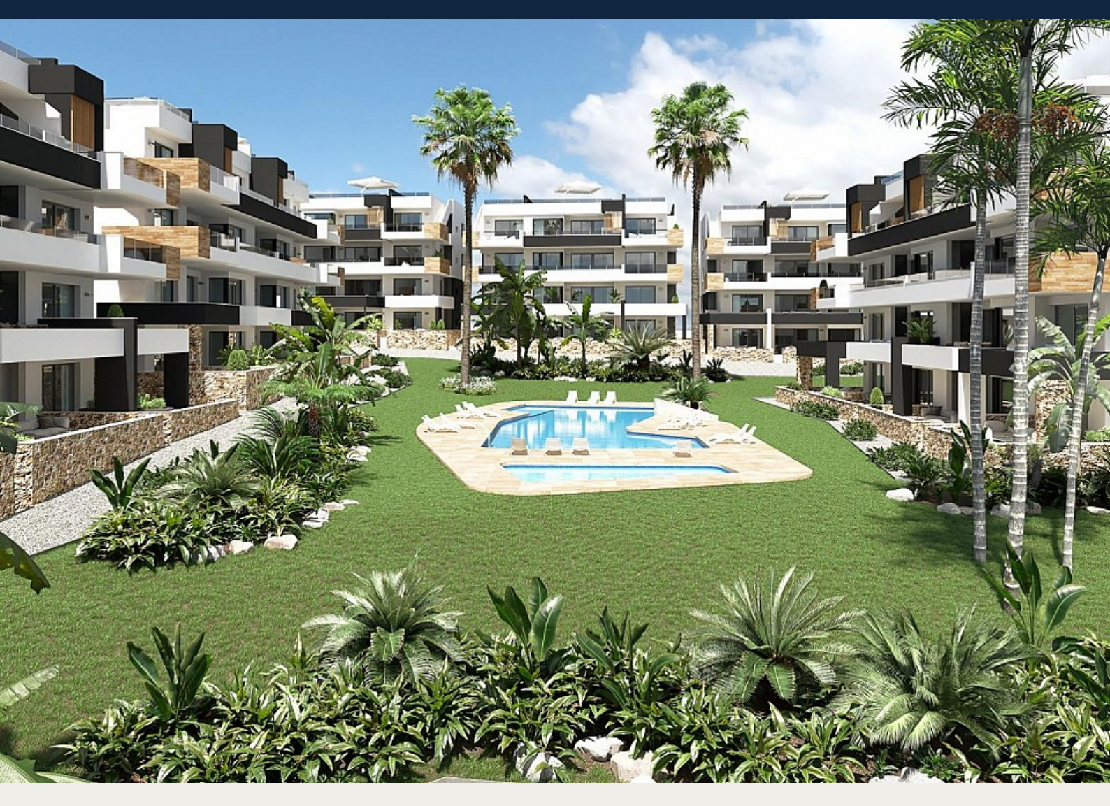
Apartment in Orihuela Costa - New build