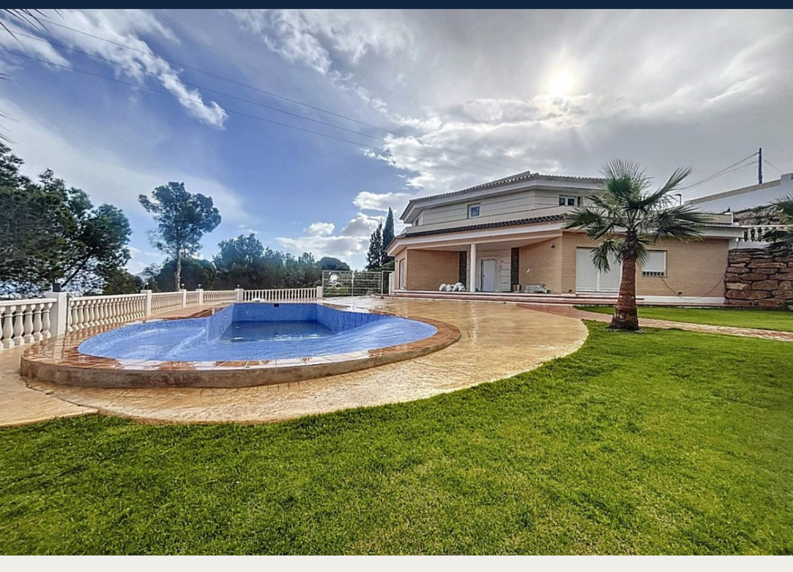
Detached Villa in La Nucía - Resale