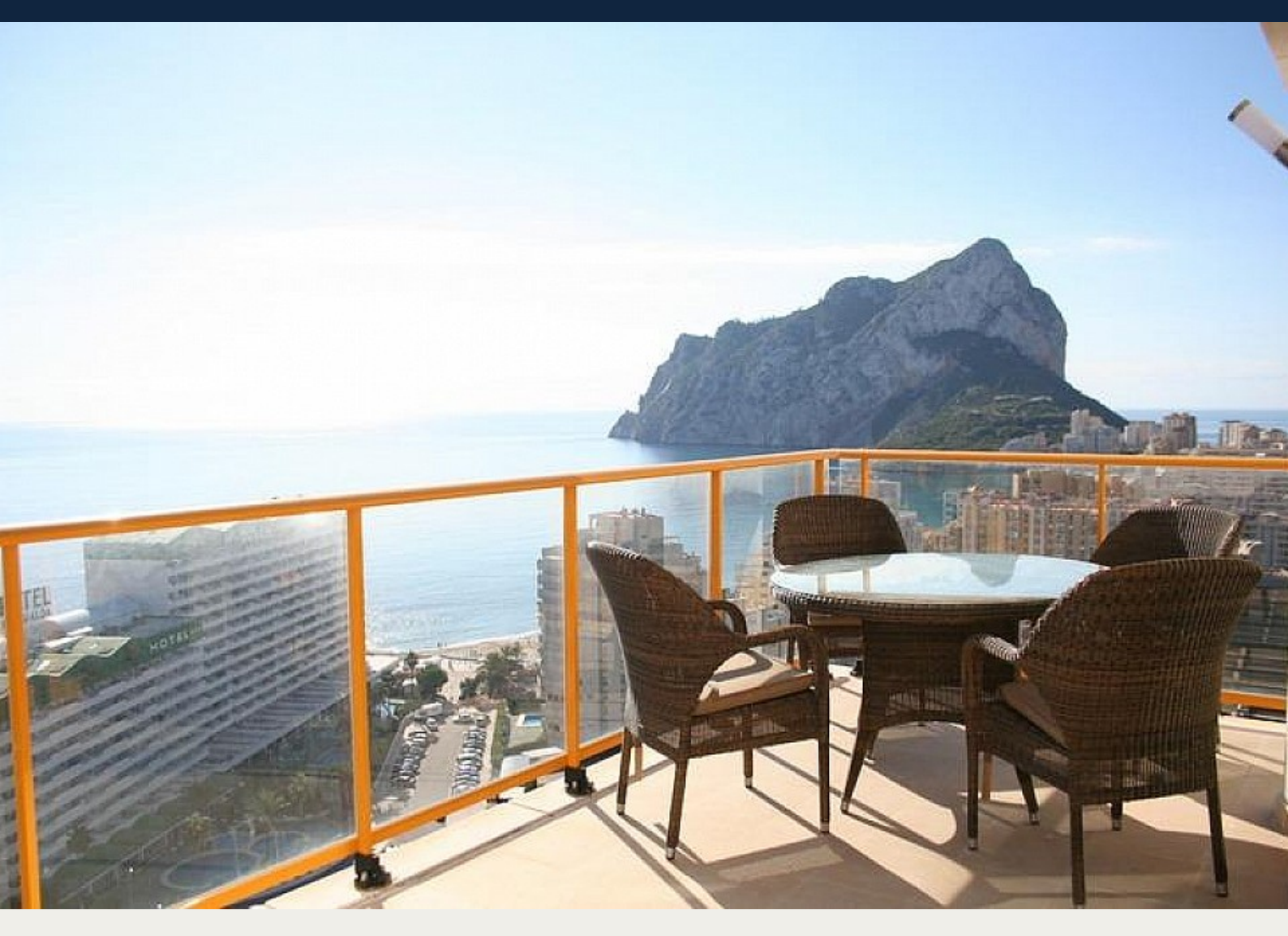
Penthouse in Calpe - New build