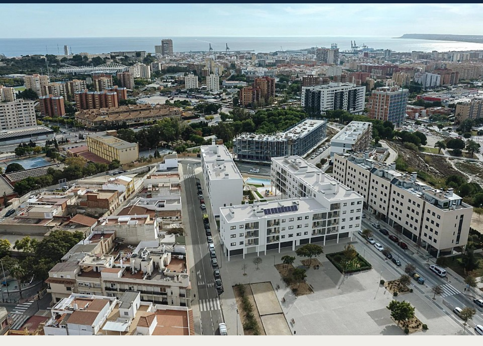
Penthouse in Alicante - New build