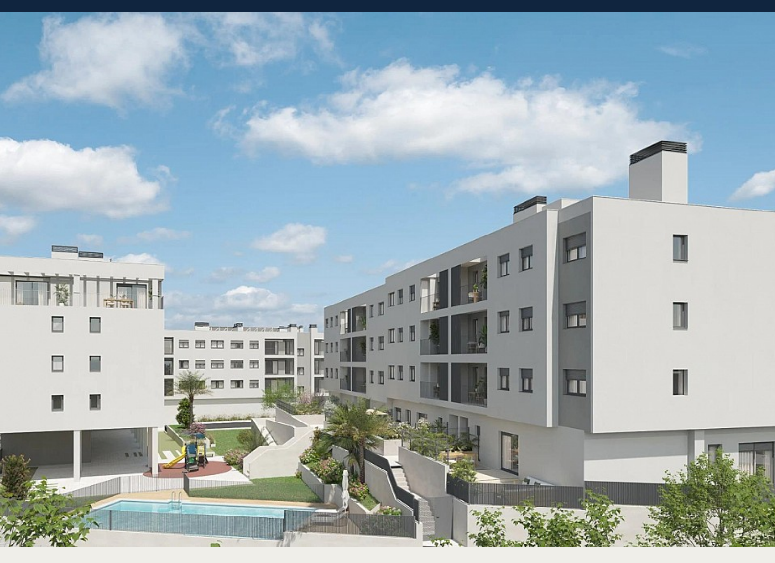
Apartment in Alicante - New build