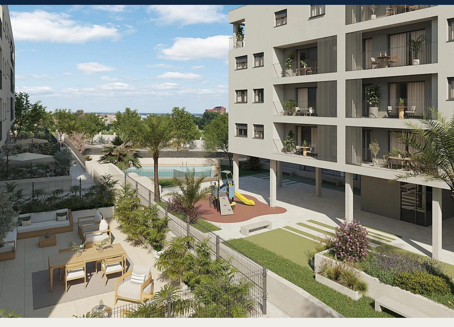
Apartment in Alicante - New build