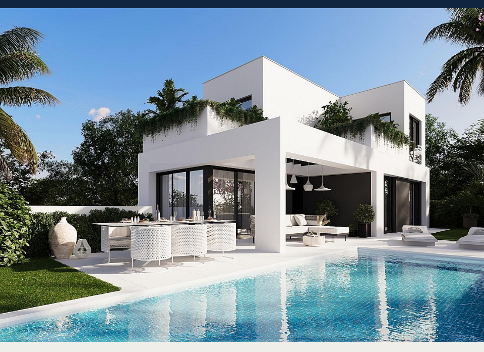
Detached Villa in Finestrat - New build