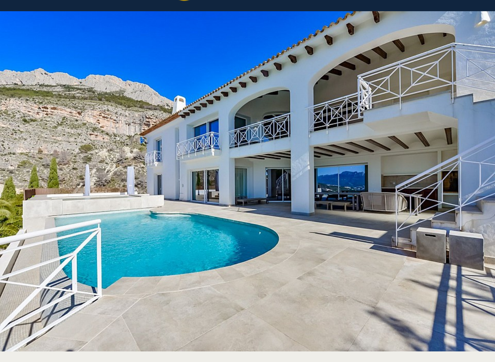
Detached Villa in Altea - Resale