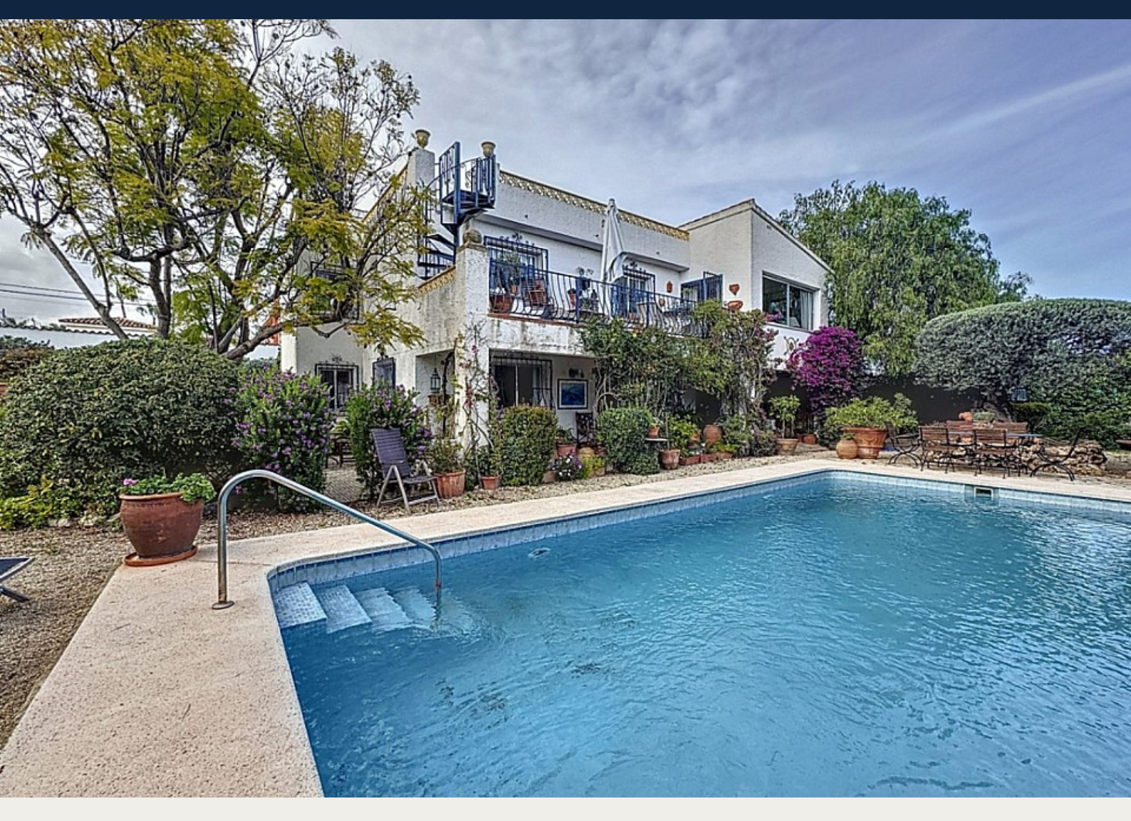
Detached Villa in Alfas del Pi - Resale