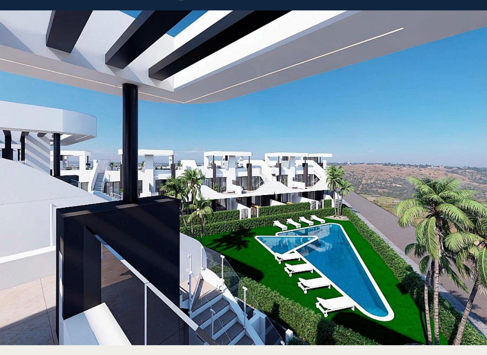
Bungalow in San Fulgencio - New build