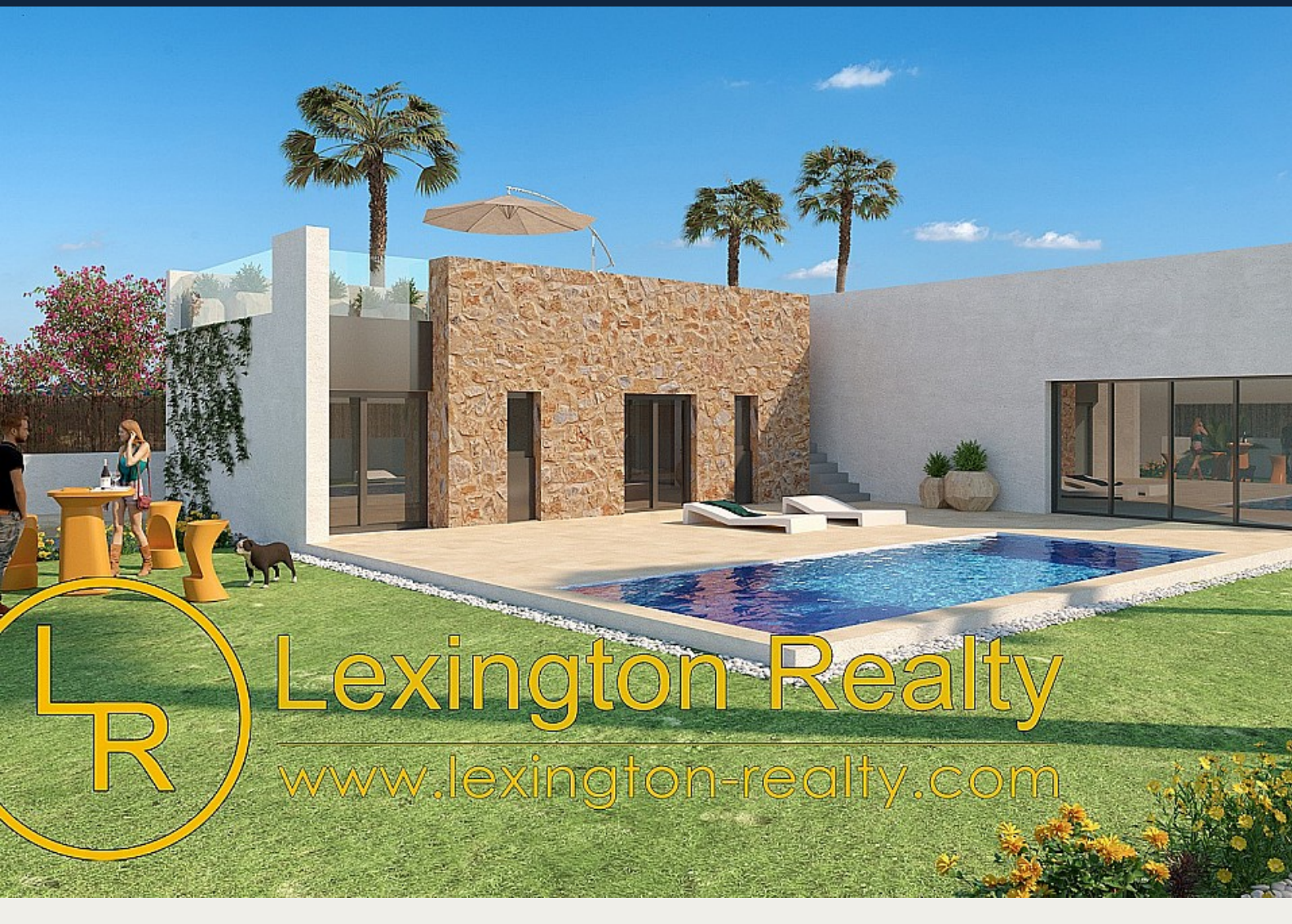
Detached villa in La Finca Golf Algorfa