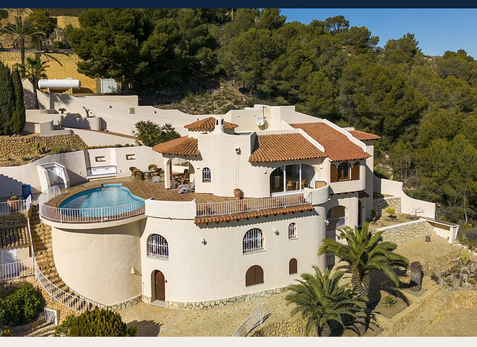
Detached Villa in Alfas del Pi - Resale