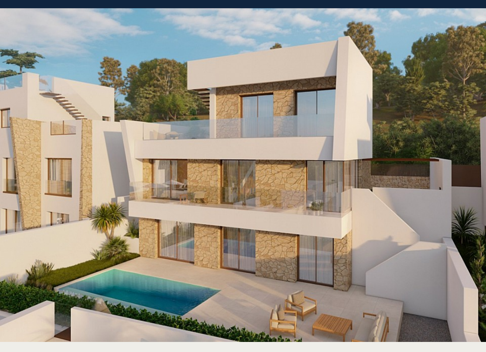
Detached Villa in Finestrat - Resale