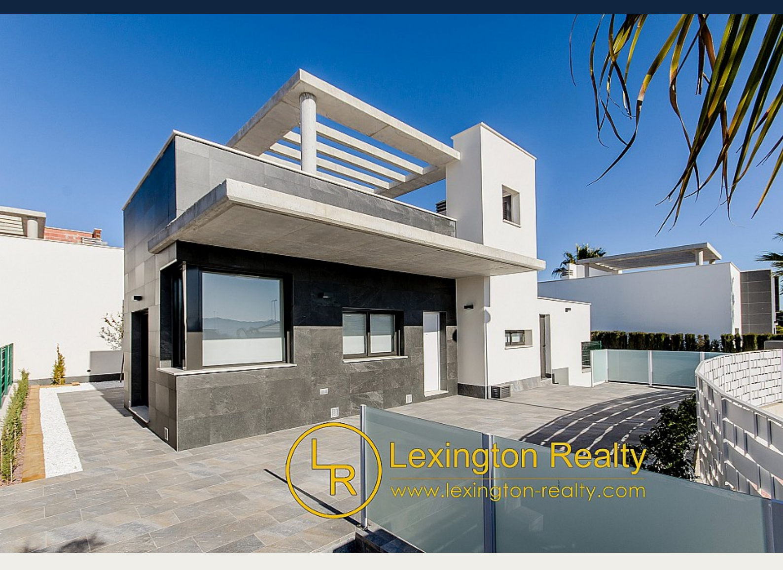
Villa à Murcia - Construction Neuf