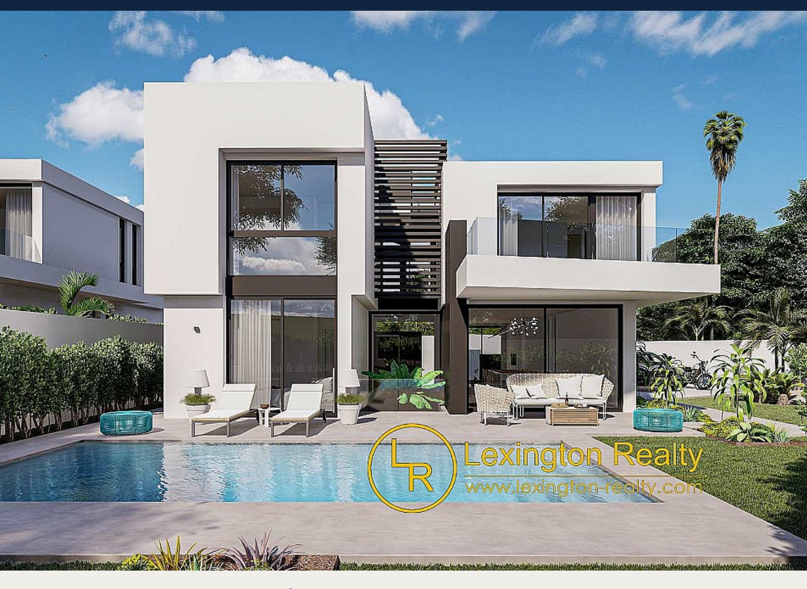
Villa à Finestrat - Construction Neuf