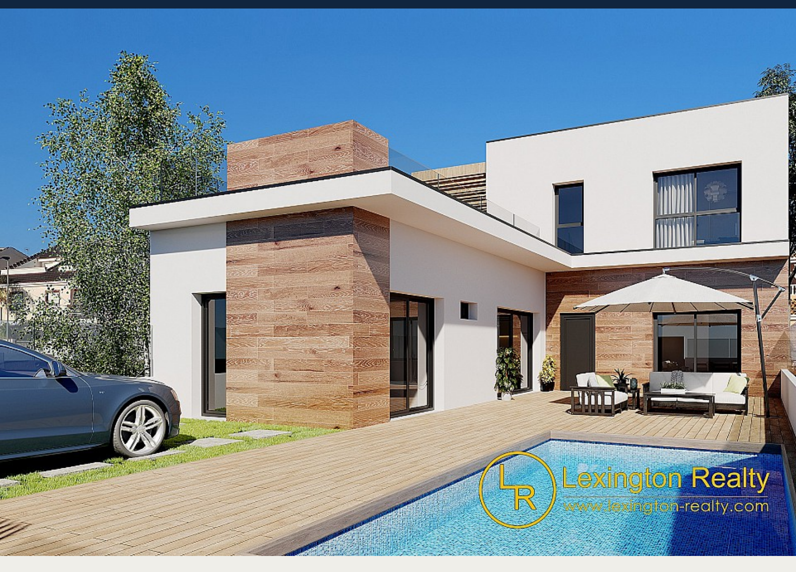
Villa à San Javier - Construction Neuf