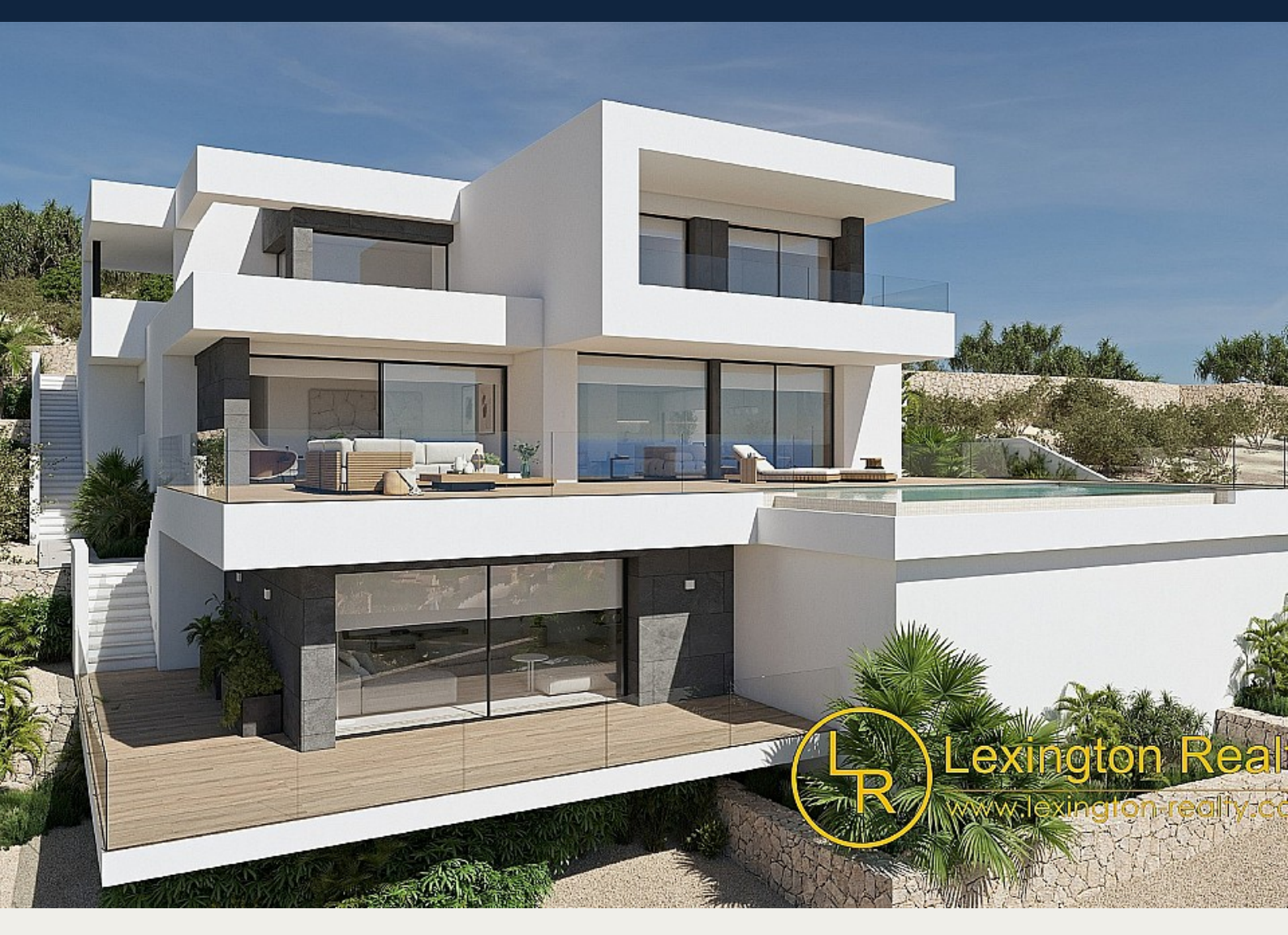
Villa in Cumbre del Sol - Nieuw gebouw