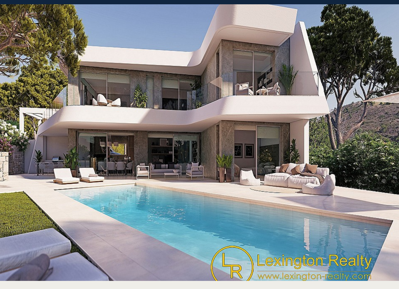
Villa i Moraira - Nybygg