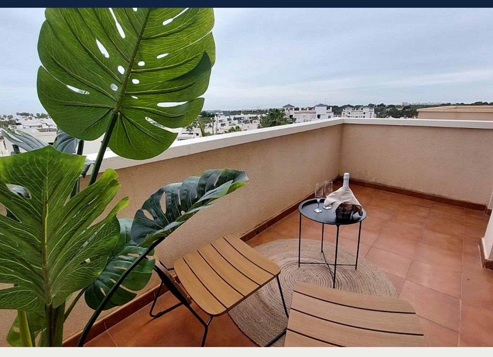
Takvåning i Orihuela Costa - Nyproduktion