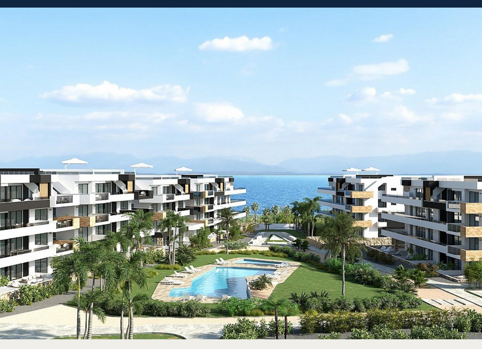
Lägenhet i Orihuela Costa - Nyproduktion