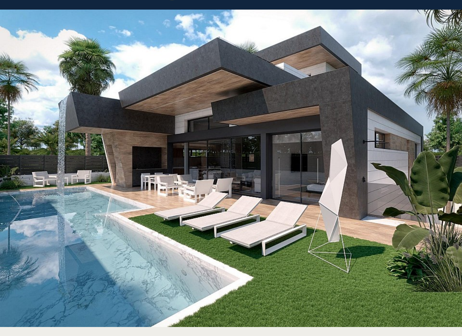
Fristående villa i Torre Pacheco - Nyproduktion