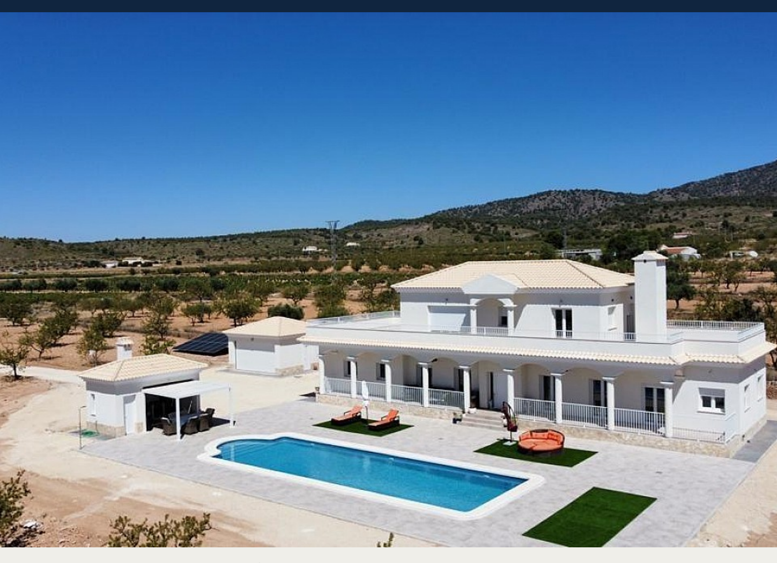
Fristående villa i Pinoso - Nyproduktion