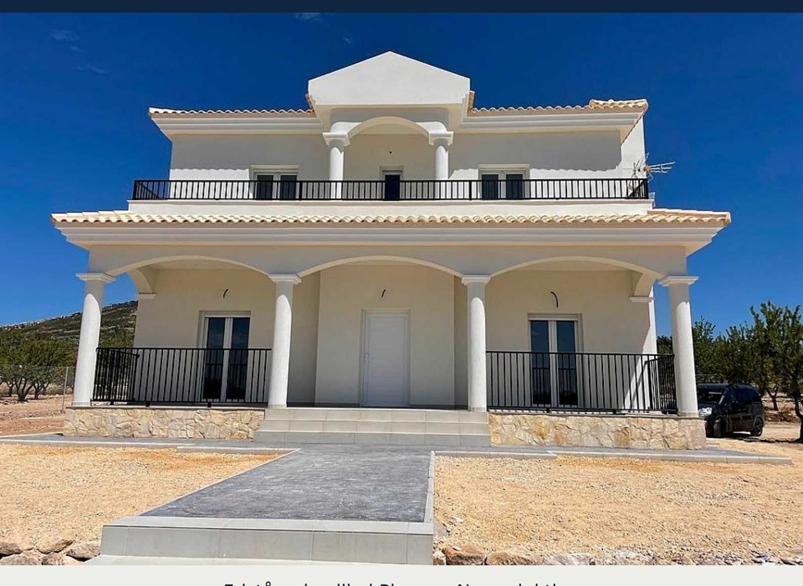
Fristående villa i Pinoso - Nyproduktion